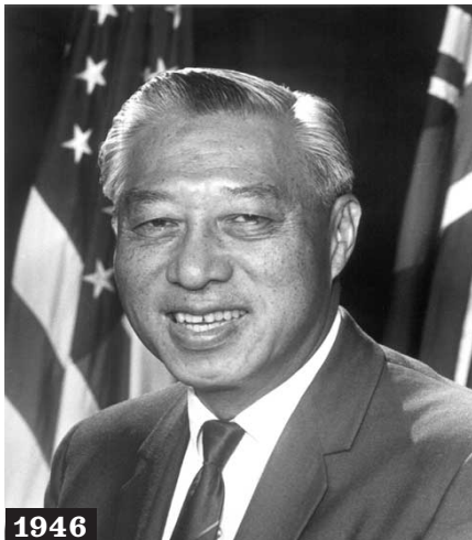
1946 Wing Ong, the first Asian American elected to state office